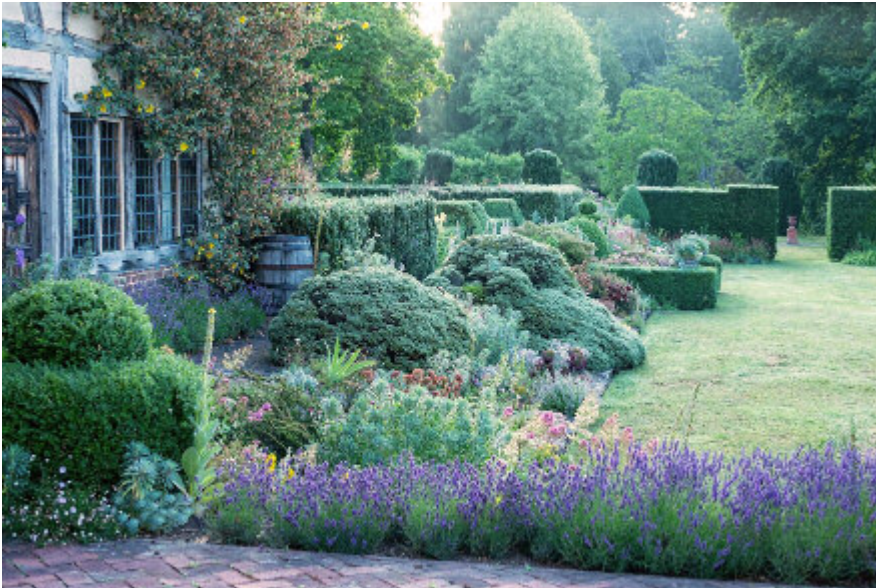
Above: Long Barn gardens

The Abbey is the home of an active Anglican Benedictine community, which has resided there since 1916. It is also home to St Augustine's College of Theology, a non-residential theological college. We were spoilt by the most wonderful weather and shown around this extremely special place by the knowledgeable and generous Mother Abbess. It was a fantastic day out and I would recommend any Gundulf Society member who did not manage to go, to book onto one of our future trips. A return trip is scheduled for September.